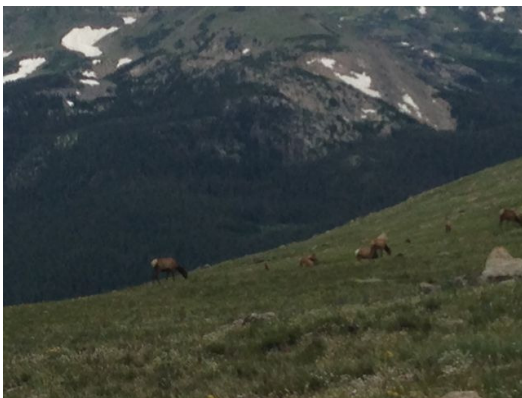
Elk in the meadow!

Look for Part II in the coming issue of the Matterhorn and we will travel the west side Of Colorado!