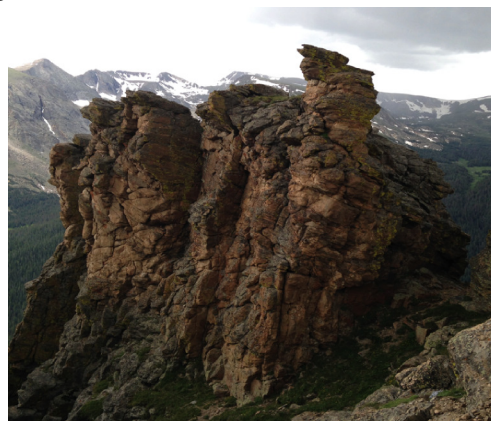
Rocky Mountain State Park